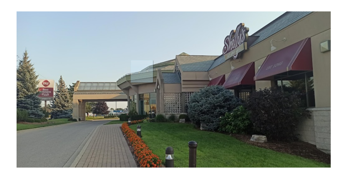
"Here I am Lord, Send Me"

restaurant at the Lamplighter for your convenience. If you are wishing to eat breakfast here, please indicate on your registration form that we are able to provide the venue with numbers so they are able to staff accordingly to accommodate us.